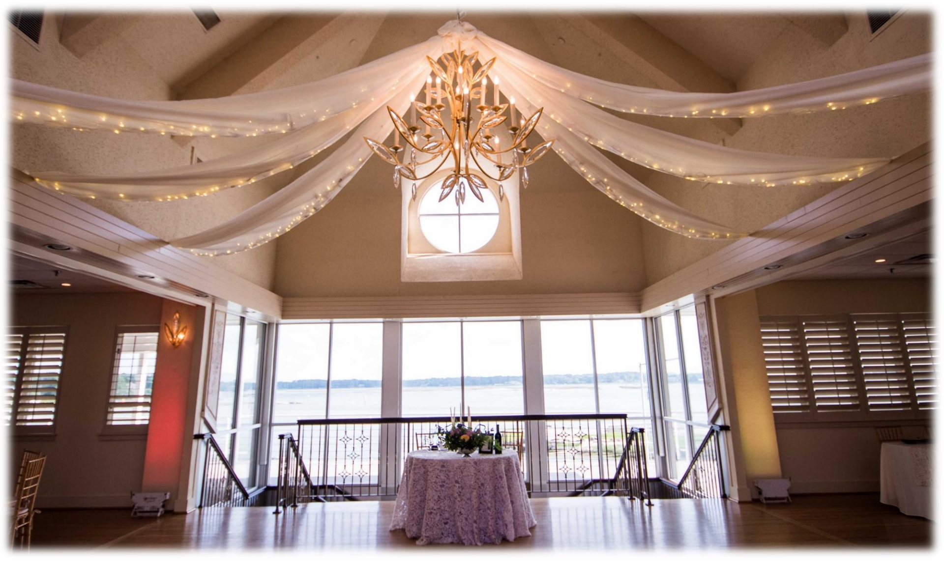
Set of six swags

Includes lights. Available in Lesner Hall only.