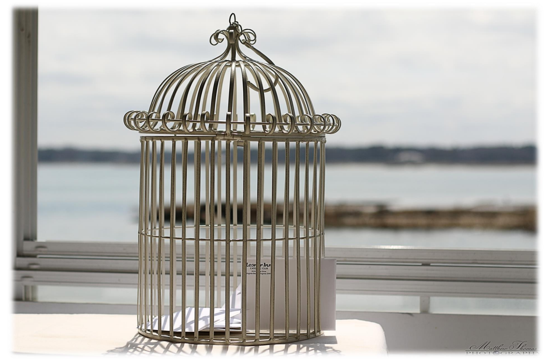
Bird cage card holder $20 a la carte