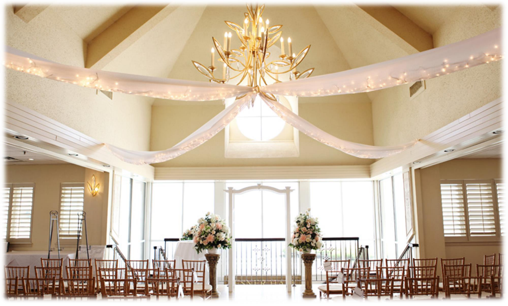
Set of four swags